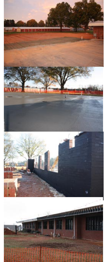
Photos of Gates Expansion October 2008- May 2009