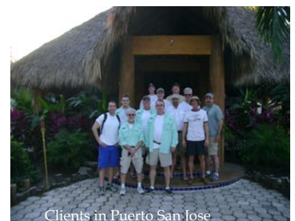
Clients in Puerto San Jose